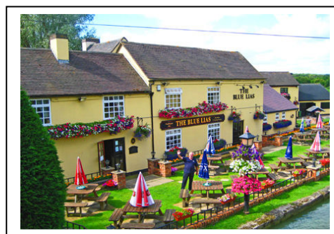
Blue Lias host, Brian, waving goodbye